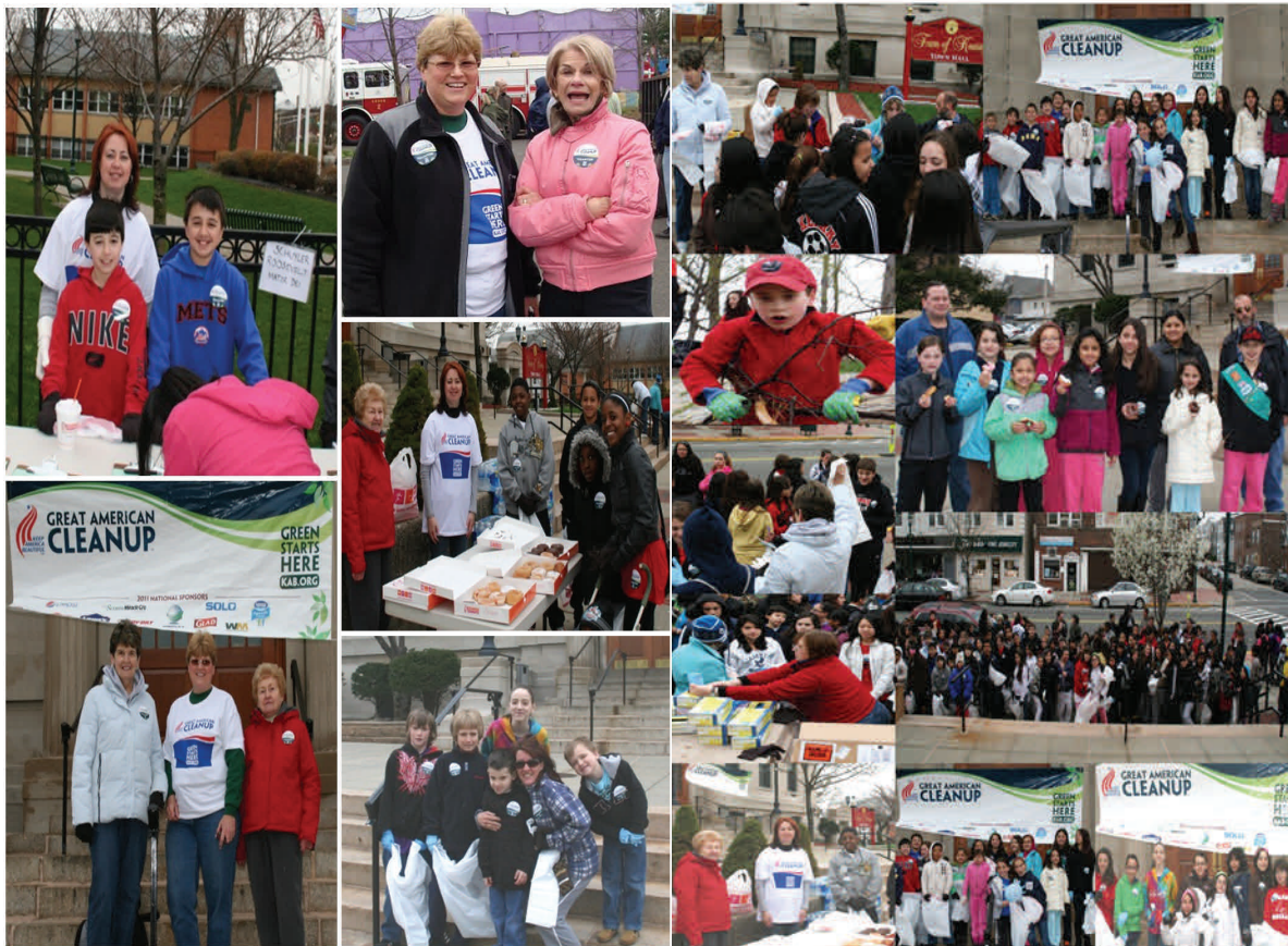
Kearny NJ April 8, 2011

"Great American Cleanup, the nation's largest community improvement program, takes place annually from March 1 through May 31,"